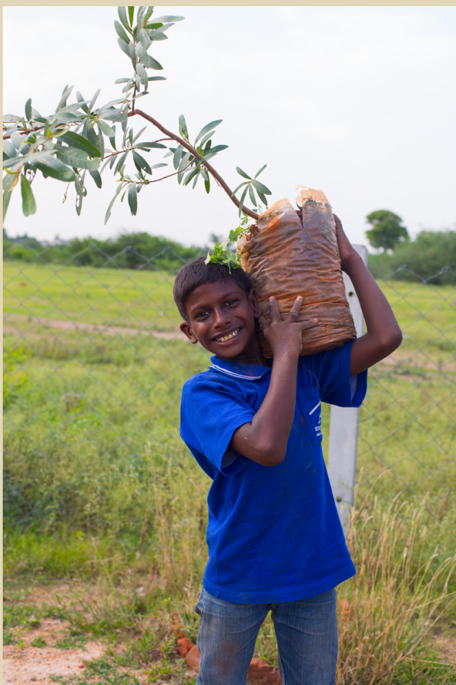
Visions India leadership students planted 25 trees as part of a special 2-day session on Environmentalism

For the 12th year running, Visions conducted its annual summer volunteer trips -- this time to Ethiopia (9 volunteers) and India (8 volunteers). What a motivating and inspiring experience it is to spend time on the ground working side by side with our local partners and the youth they serve!