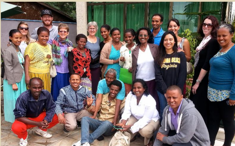
Local deaf leaders, interpreters, & teachers took part in a 3-day capacity building training designed to help build up a more thriving Deaf civil society in Ethiopia